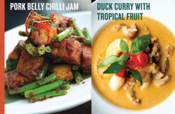
PORK BELLY CHILLI JAM