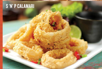
S 'N' P CALAMARI