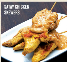
SATAY CHICKEN SKEWERS