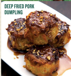
DEEP FRIED PORK DUMPLING