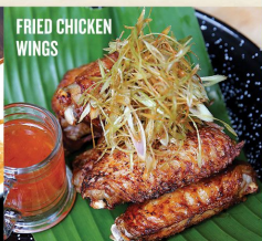
FRIED CHICKEN WINGS