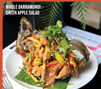
WHOLE BARRAMUNDI : GREEN APPLE SALAD

Served with pickle ginger and spicy sauce