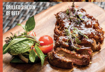
GRILLED SIRLOIN OF BEEF