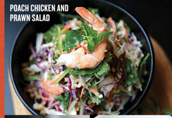
POACH CHICKEN AND PRAWN SALAD