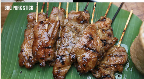
BBQ PORK STICK