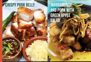
CRISPY PORK BELLY